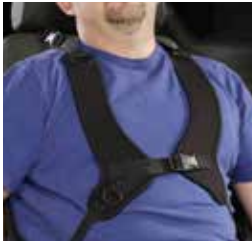
Posture vest and positioning belt