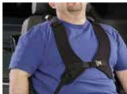
Posture vest and positioning belt